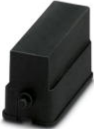
Protective cover for sleeve housing, IP54

Please be informed that the data shown in this PDF Document is generated from our Online Catalog. Please find the complete data in the user's documentation. Our General Terms of Use for Downloads are valid ( http://download.phoenixcontact.com )