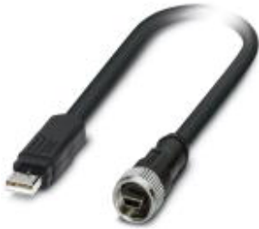
Assembled USB cable, shielded, color: black, PVC outer sheath, USB mini-B/IP20 on USB type A/IP20, length: 2 m

Please be informed that the data shown in this PDF Document is generated from our Online Catalog. Please find the complete data in the user's documentation. Our General Terms of Use for Downloads are valid ( http://download.phoenixcontact.com )