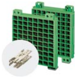
Connection honeycomb, Connection type: Screw mounting, Number of positions: 80, Color: green

Please be informed that the data shown in this PDF Document is generated from our Online Catalog. Please find the complete data in the user's documentation. Our General Terms of Use for Downloads are valid ( http://download.phoenixcontact.com )