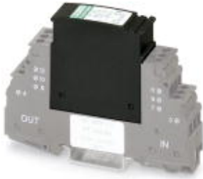
PT protective connector with protective circuit for a 2-wire floating signal circuit. HART-compatible.

Please be informed that the data shown in this PDF Document is generated from our Online Catalog. Please find the complete data in the user's documentation. Our General Terms of Use for Downloads are valid ( http://download.phoenixcontact.com )