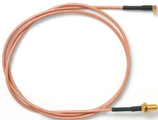
Model 73066 MMCX Right-Angle Plug to SMA Bulkhead Jack, RG316/U

Small size, and durability for confident connections