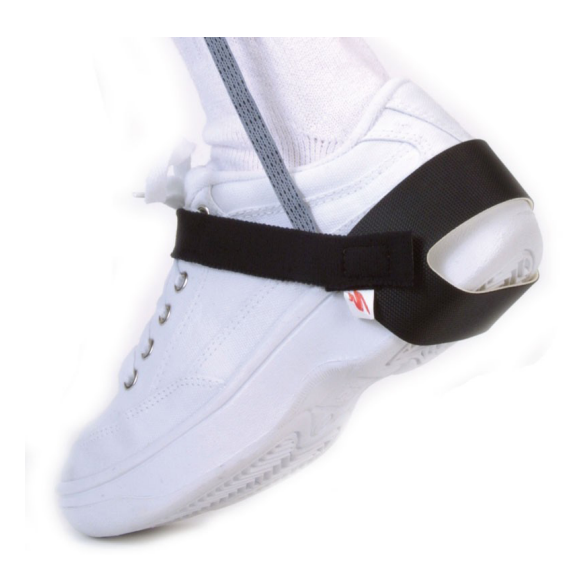
Elastic Hook and Loop Strap for Comfort and Visibility